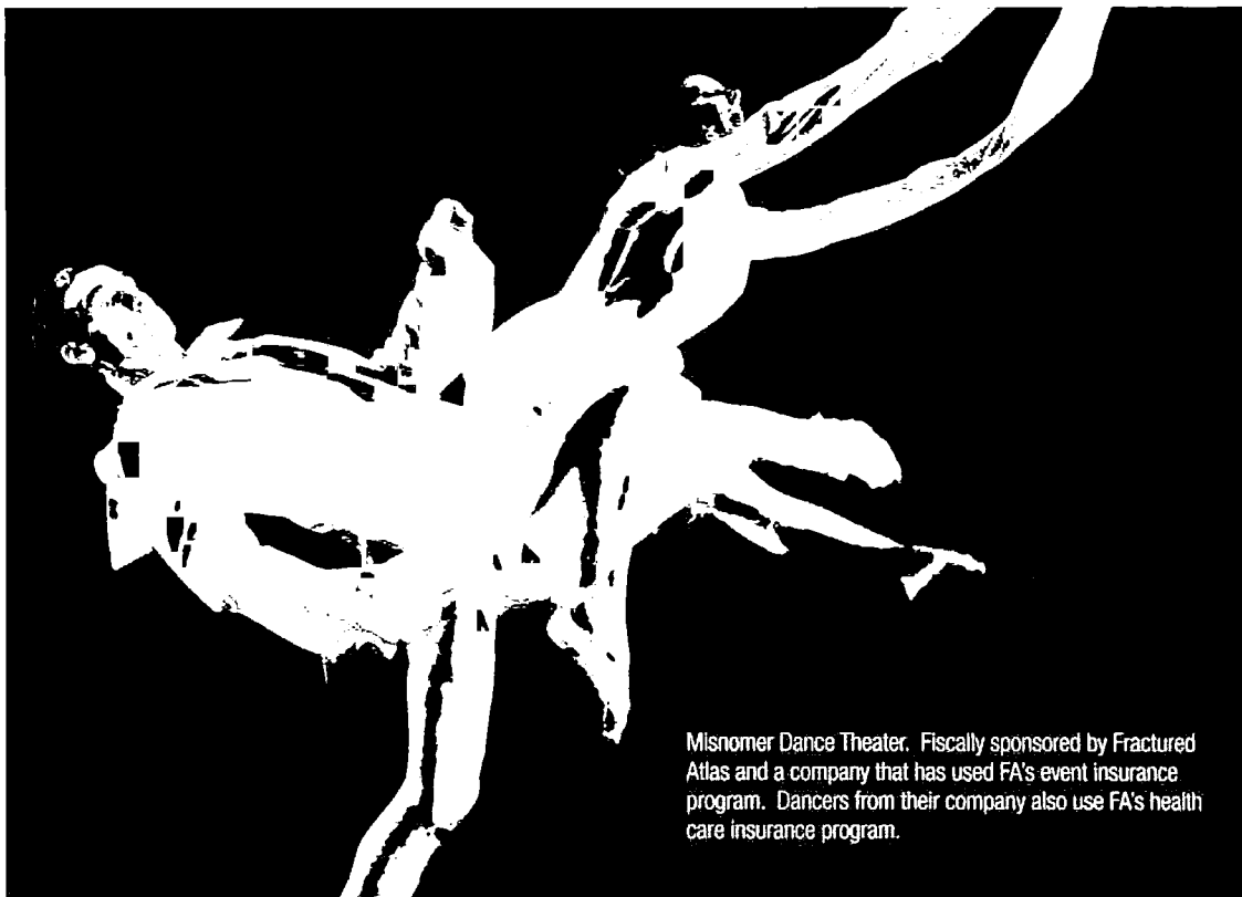
Misnomer Dance Theater. Fiscally sponsored by Fractured Atlas and a company that has used FA's event insurance program. Dancers from their company also use FA's health care insurance program.